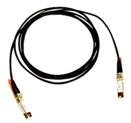
Cisco SFP+ Active Optical Cables

Figure 3. Cisco Direct-Attach Twinax Copper Cable Assembly with SFP+ Connectors