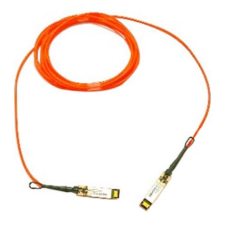
Figure 4. Cisco Direct-Attach Active Optical Cables with SFP+ Connectors