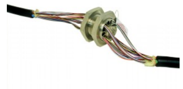
WGF-12 Shown with 24 strand fiber installed