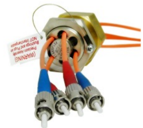
WGF-6 Shown with ST fiber installed