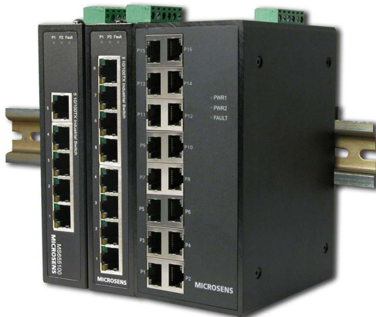
Fig. 1: Entry Line Fast Ethernet Switches

All new devices distinguish themselves with easy handling (Plug&Play) and do not need extensive configuration. New developments are focusing on increasing the port numbers and further implementation of Gigabit Ethernet.