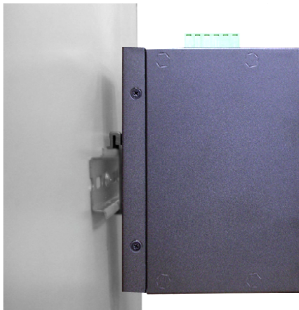
Fig. 4: Installation to DIN-Rail Step 2