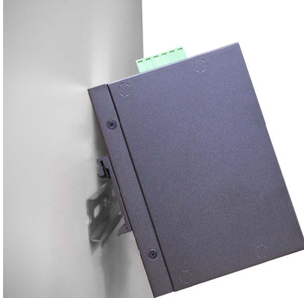
Fig. 3: Installation to DIN-Rail Step 1